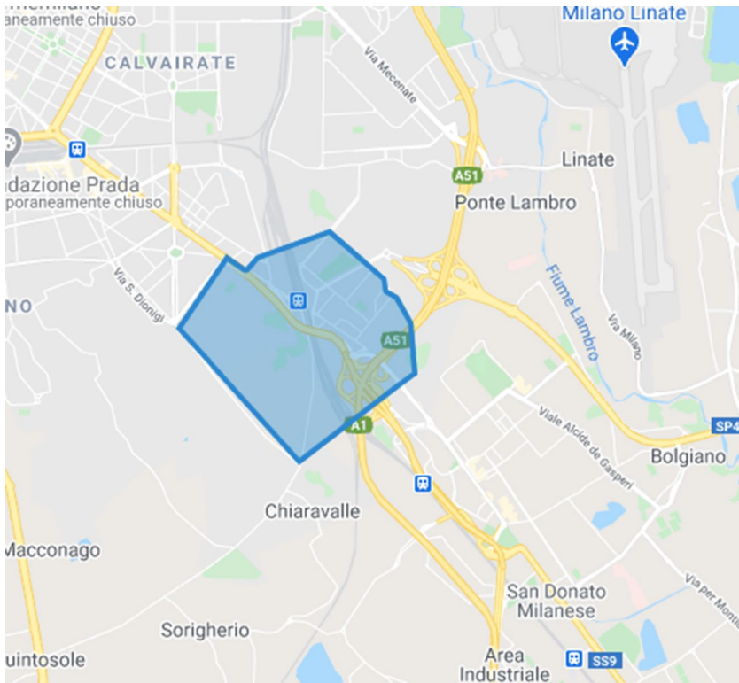
Fig. 4 Rogoredo urban area

be relocated into fragmented territorial environments that create boundaries. Boundaries, in this case, differentiate two communities (the old residents and the new mainly migrant communities) from an ethnic point of view (Sennett 1977), but, in this case, more for the time of permanency in the neighbourhood. These boundaries are closed, the expression of a desire of a social group to maintain its identity because of an exclusionary process (Newman 1972, 2003).