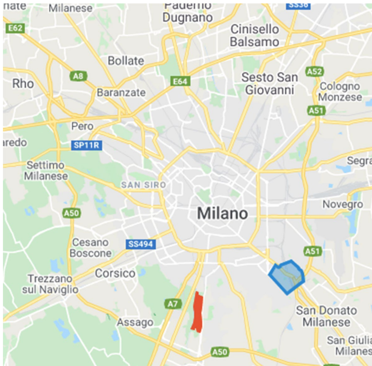
Fig. 1 The two neighborhoods in the city map

interviews, participant observation and focus groups. The details of the research design included the qualitative phase devoted to a process of qualitative data collection in 10 selected neighbourhoods and the corresponding analysis of 50 in-depth interviews, six months of participant observation and ten focus groups. The participating observation included 300 interviews with residents and city users in the districts studied and an uncovered observation of the daily life of the people under the study. The overall results of the research are available on the official report. 2 The criteria used to select the ten districts in the five European cities analyzed (Barcelona, Budapest, London, Milan and Paris) based on the definition of shared urban security within the project.