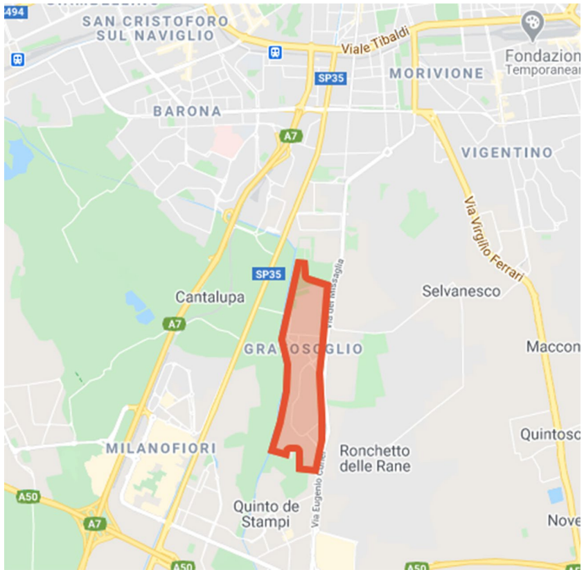
Fig. 2 Gratosoglio urban area

affects commerce in the area (most shops under the 16-storey towers are empty or closed), and nowadays the neighbourhood is more of a dorm than a living area. The neighbourhood is lightly populated and presents a lower level of education and a higher concentration of older adults (Censis 2019).