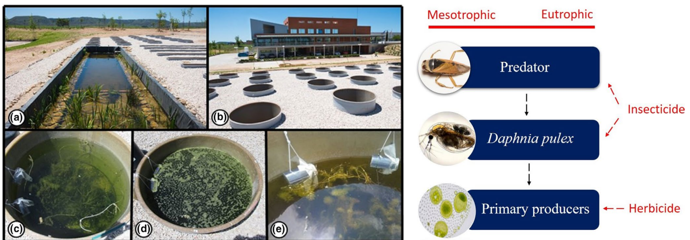
FIGURE 1 Mesocosm facilities (left) and experimental setup (right). Biodiversity lagoon used to fill in the mesocosms (a), outdoor mesocosms (b), mesotrophic mesocosms (c), eutrophic mesocosms (d), detail of experimental cages containing Daphnia pulex alone and Daphnia pulex with one individual of Notonectidae sp. (e).

By testing these species and stressor combinations, we aimed to gain mechanistic understanding on the effects caused by multiple stressors on freshwater populations. We hypothesized that direct toxic effects of chlorpyrifos on D. pulex and the indirect effects of diuron caused by a decrease in food availability will decrease D. pulex fitness, increasing its population susceptibility to the predator. Moreover, we hypothesized that the susceptibility of D. pulex will be larger when chlorpyrifos and diuron co-occur, and we expected to see an influence of the trophic status on the response to the single and combined effects of the evaluated pesticides.