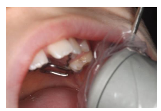
Figure 1. Low-level laser therapy (LLLT) administration. The optical fiber tip was moved from vestibular toward the palatal side of the upper first molar for 10 s (each session).

On the same day, after placement of the orthodontic device, LLLT (AlGaAs diode laser emitting infrared radiation at 980 nm) was administered in the office. The size of the spot tip was (1 cm²) and laser irradiation was performed in continuous wave mode (1W output power, 1J/cm² energy density per point) by positioning the optical fiber tip over the first molar on both sides (anchoring teeth) with a single spot application moving the tip from vestibular toward the palatal side for 10 s. The procedure was repeated 3 times at an interval of 10 s. Thus, each molar received a total fluence of 30J/cm². (Figure 1). The procedure of data collection was entrusted to another operator (G.C.).