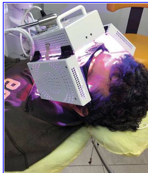
FIG. 1. The ATP38 ® (Biotech Dental, Allée de Craaponne, Salon de Provence, France) was used in this study to perform PBM. See the three panels placed at a 4 cm distance from the patient's cheeks (lateral panels) and lips (frontal panel). PBM, photobiomodulation.

PBM was administered to the PBM group using the ATP38 ® (Biotech Dental, Allée de Craaponne, Salon de Provence, France). This device features a multi-panel system emitting cold polychromatic lights with a combination of wavelengths from 450 to 835 nm depending on the field of