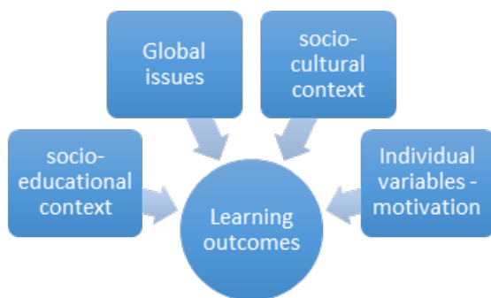
Figure 1. Gardner's model of the factors affecting learner outcomes