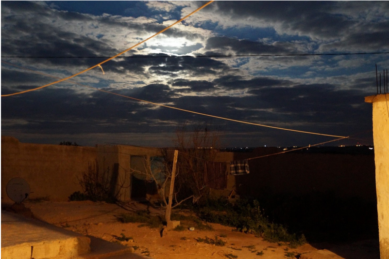
3. Internal courtyard of a house in Gosbah at dusk.