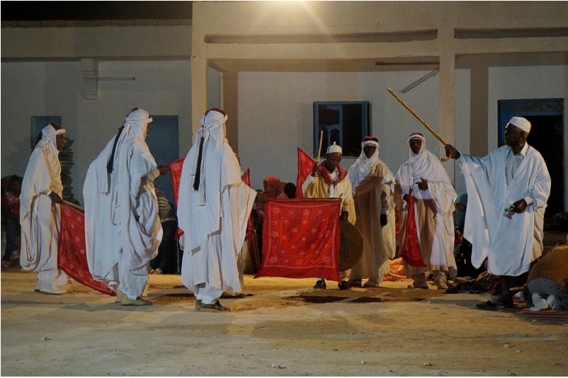
5. Tayfa singers performing at a wedding in Gosbah.