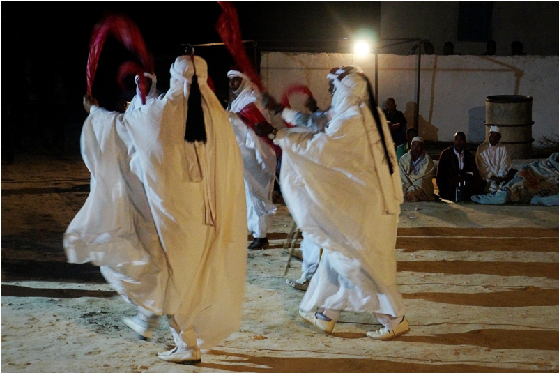
6. Tayfa singers dancing and waving the red neckerchief.