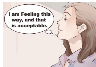
Associations between difficulties in emotion regulation and empathy levels