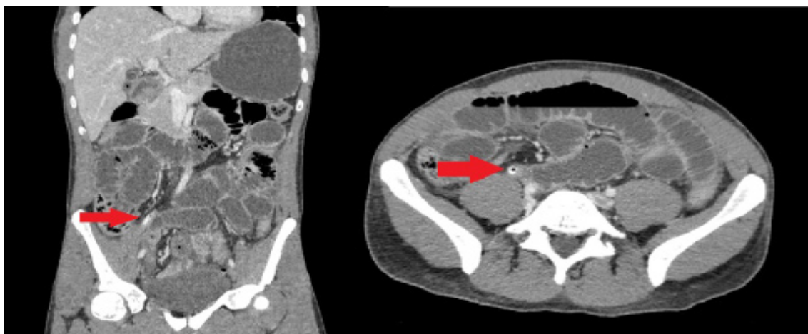
Figure 1: CT scan. Arrow: Meckel's Diverticulum