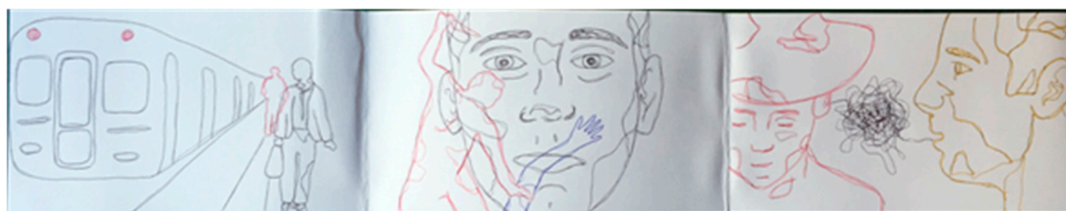
Figure 2. Exercises in Style, texticule: Blurb , developed in the Visual Design class 2016–2017 by Edoardo Bassetto.

around a scarce subject). I wrote Exercises in style, realizing myself, and quite consciously, of Bach and especially of that execution at the Pleyel Hall” [17].