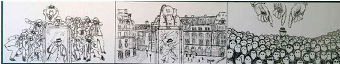
Figure 5. Exercises in Style, texticule: The Subjective Side developed in the Visual Design class 2016–2017 by student Guglielmo Monnechi.

Starting from the lower level, we can identify some recurring approaches: