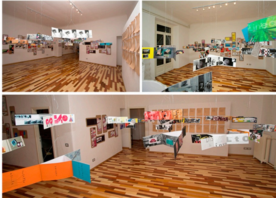
Figure 1. Images of the exhibition: “Percorsi Visivi” held in 2006 at the headquarters of AIAP Italian Association of Visual Design: visual style exercises workshop results 2002–2006.

The proposed activity has the scope to teach non-designers’ student [18,19] the basics of the graphical language and the verbal-visual rhetoric according to the meaningful learning method developed by Ausubel [20] base on a learning-by-doing [21] proposal.