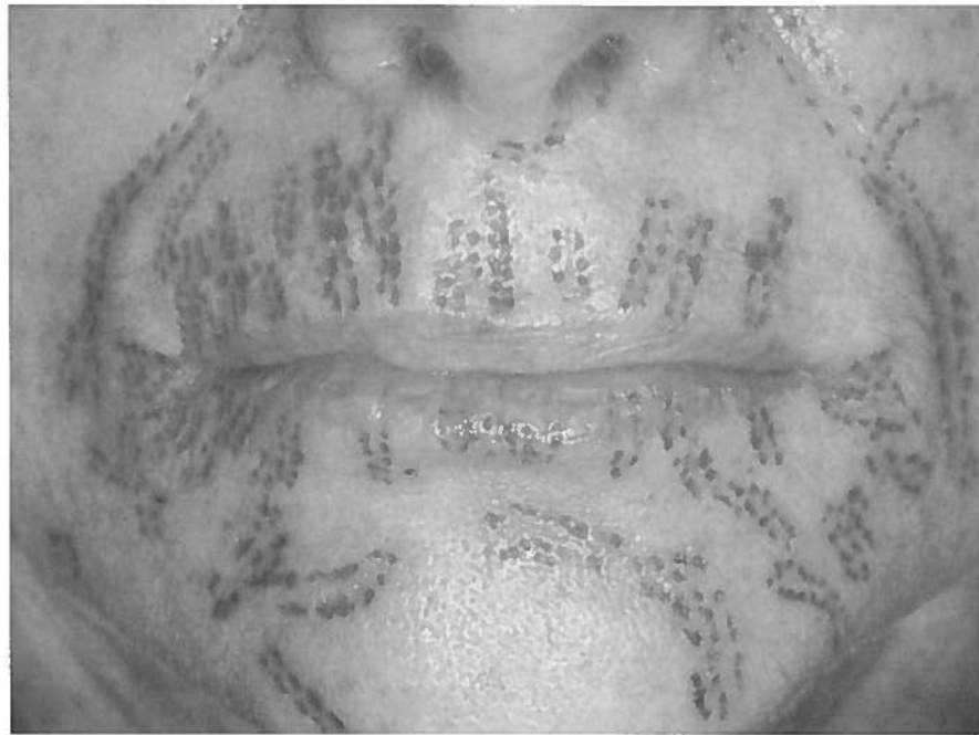
Fig. 3. Appearance of a typical patient immediately after undergoing to dermabrasion with voltaic arc technique.