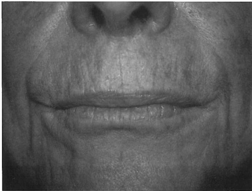
Fig. 2. Before treatment of perioral rhytids.

dermis, which enhances the tensile strength of the skin and yields the clinical appearance of rejuvenation. Ablative resurfacing achieves the outcome of rejuvenation by the destruction of the outermost and thus most photodamaged layers of the skin. The subsequent laying down of newly