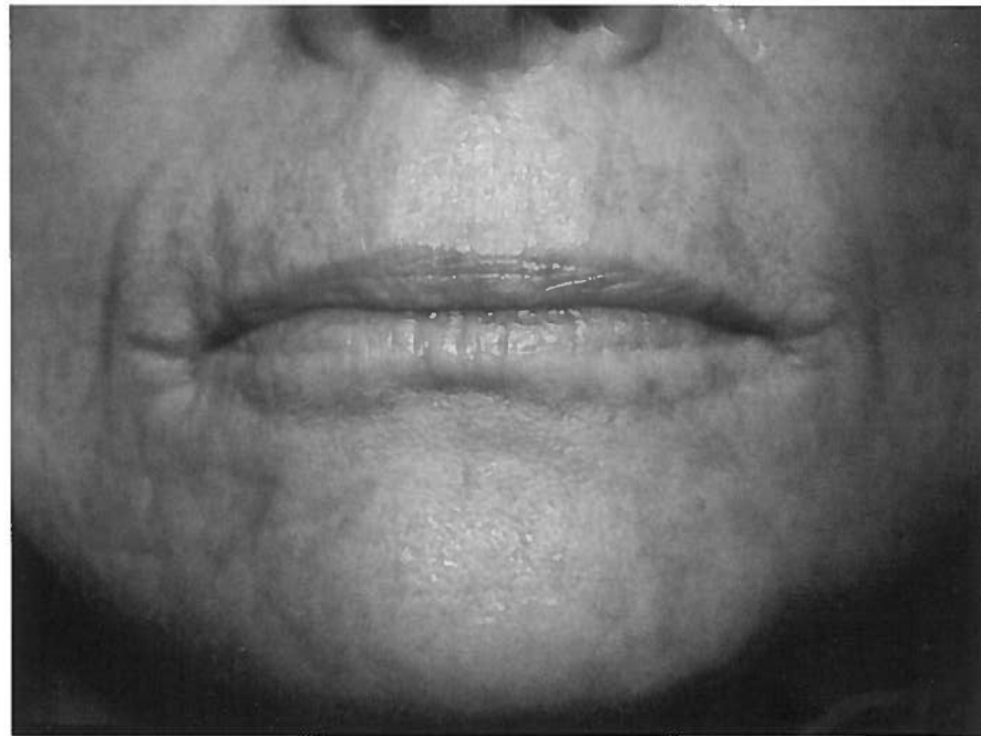
Fig. 4. Postoperative photograph of a patient after 1 month treatment resulted in a better cosmetic outcome

electro-dermabrasion are experience and understanding of its principles to provide sufficient resurfacing to the appropriate depth and minimize scar formation. Careful patient screening is crucial to ensure realistic expectations.