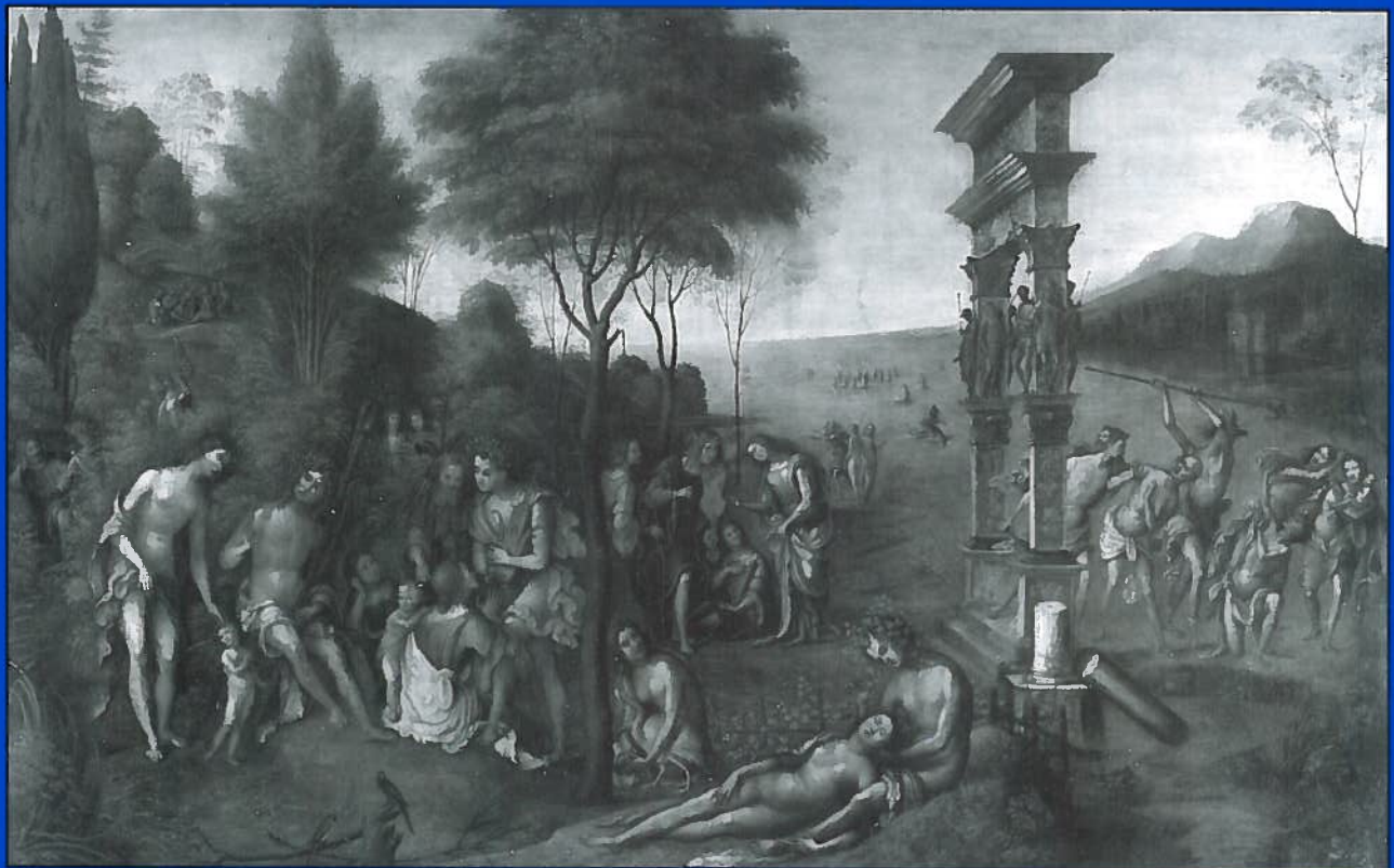
Luca Signorelli - "Prometeo" - Cortina

Official Journal of the Italian Society of Oral Pathology and Medicine