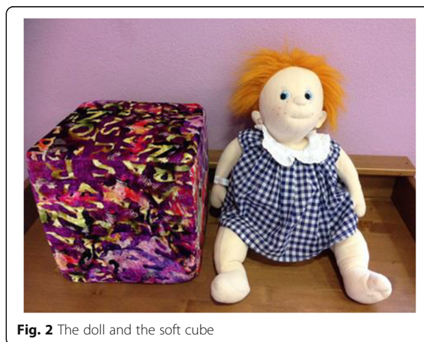
Fig. 2 The doll and the soft cube

The object (doll or cube) presentation procedure will be structured in five standard steps as follows: