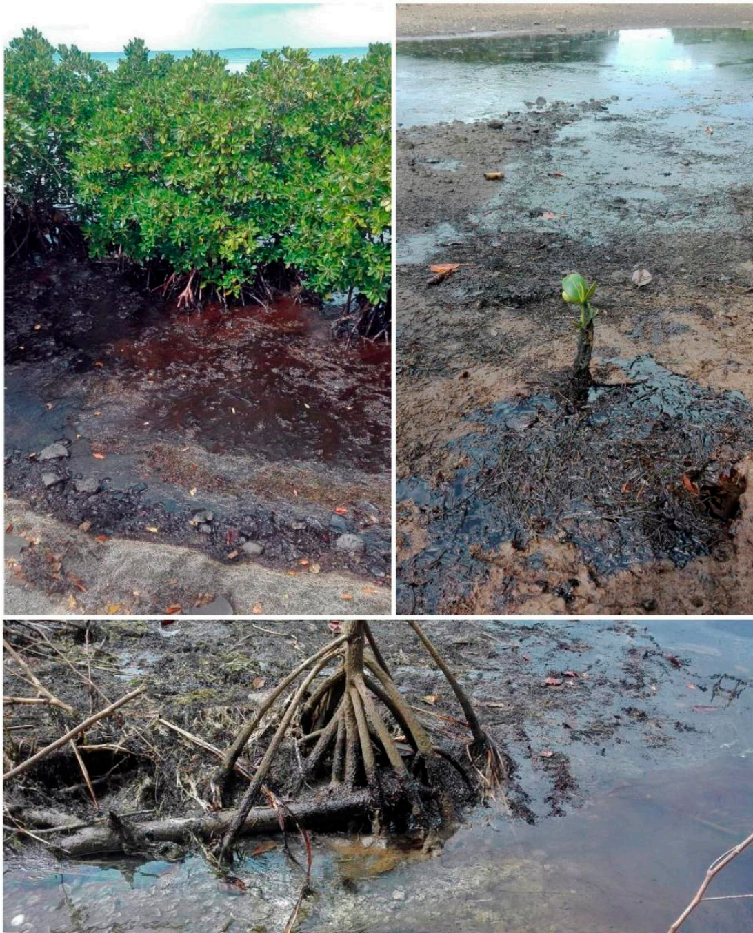
Figure 3. The oil spill has heavily affected the mangroves forest. Large and dense oil stains cover the shallow basin where the trees develop and affect a young mangrove propagule as well as the mangrove roots (Credits: Yohan Didier Louis).

in the Mauritius on the shores in the same region where the oil spill occurred. During their necrosis, no traces of hydrocarbon was found on their skin, in the digestive and respiratory tract of the animals, and therefore no direct link with oil spill was found yet [59,60]. However, further toxicological analysis revealed the presence of hydrocarbon in 11 of the dead dolphins [60].