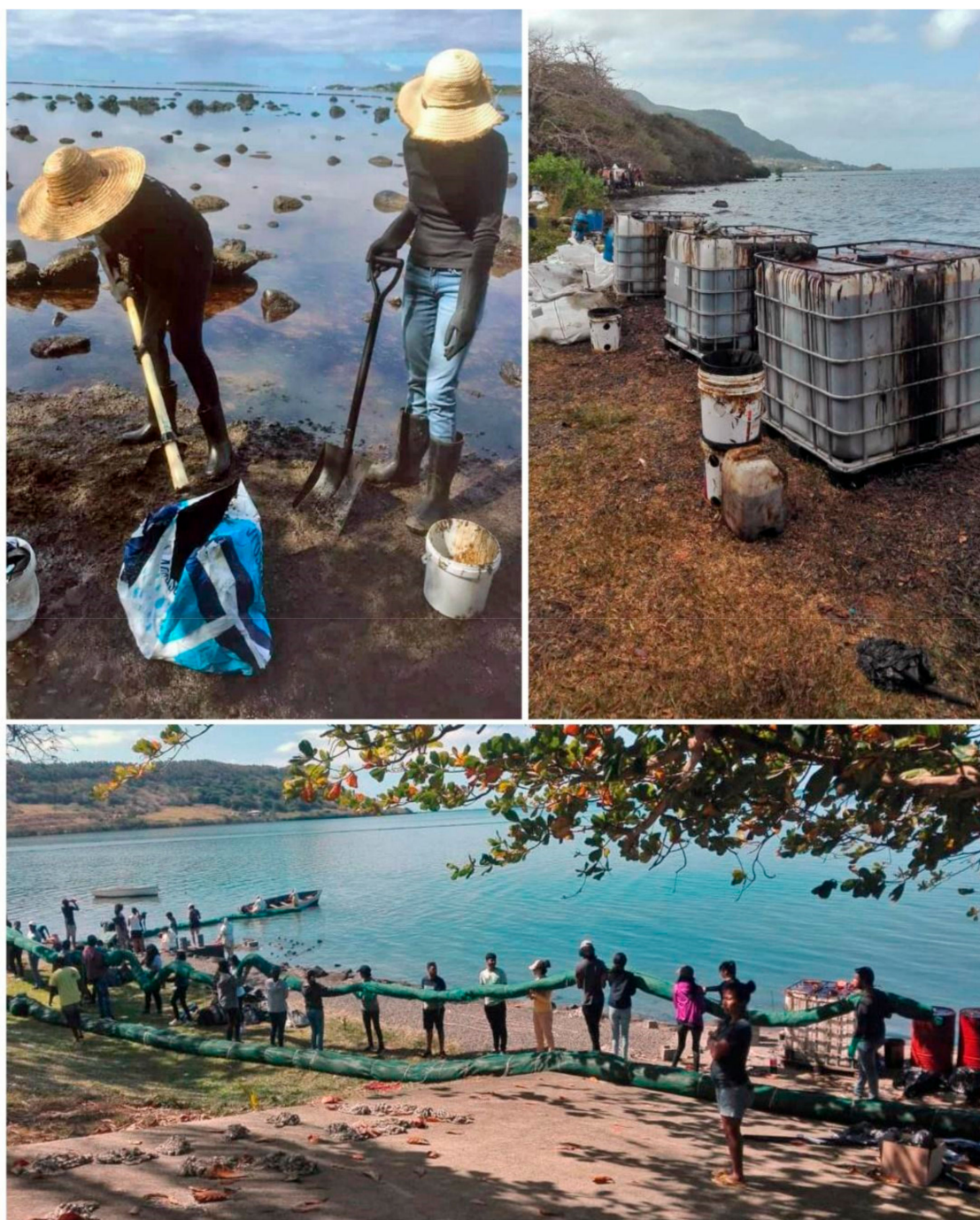
Figure 2. Citizens of Mauritius helping to fight the oil spill by collecting the spilled oil by accumulating on their beaches and by deploying artisanal booms made of dried sugarcane leaves.