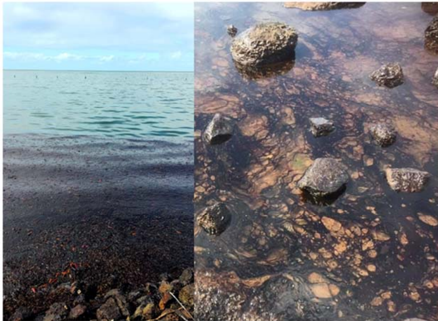
Figure 1. The MV Wakashio oil spill. In the first photo on the left, oil leaked from the ship reaching the South-east coast of Mauri-tius. On the left, close-up view of the oil spots on the sea surface (Credits: Yohan Didier Louis).

shoreline has been declared off limits, and fishing and recreational activity in those areas were banned [7,8]. Recreational activities have been re-authorized in November 2020, but fishing in the impacted areas remains banned [9]. So far, accordingly to local observation, there is no visible trace of crude oil on the sea surface, but large accumulation is still present in the mangroves forest. This may have long-term consequences on the ecosystem. Proper monitoring plans and that restoration counteraction are required, since severe toxicological effects of oil on the marine communities, from the microbial communities to the mammals, have been already detailed by several researches (reviewed in [10]).