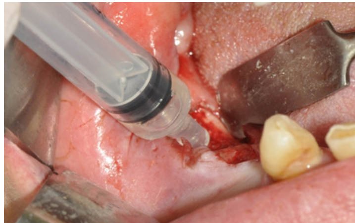
Figure 5. Intraoral intraoperative image of topical application of ozonated gel in the peri-operative phase.