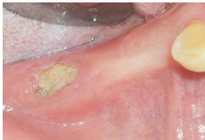
Figure 2. Intraoral image of the original situation of an osteonecrotic lesion of the IV quadrant.