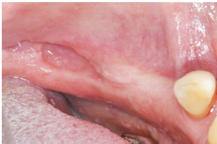
Figure 6. Complete healing of the lesion.

The results from the group of 7 patients treated with the protocol described above were compared with the results obtained from the other 4 groups with different therapies by colleagues in our department. Statistical analyses were performed with the Wilcoxon signed-rank test and the Chi-square test.