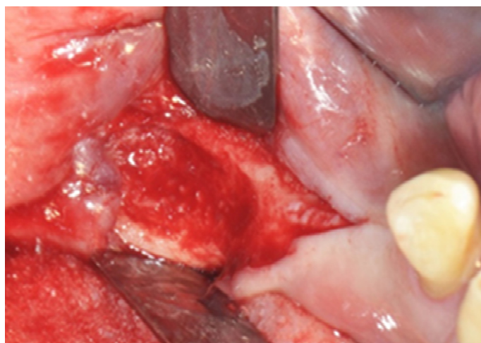
Figure 3. Intraoral intraoperative image of the elevation of the flap to full thickness.