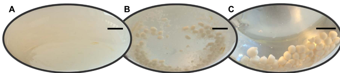
Fig. 3. Phenotypic appearance of KE6–12.A variants in shake flasks. A) KE6–12.A – non-flocculating, B) KE6–12.A expressing the strongly flocculating FLOI variant described in (Westman et al., 2014) and C) KE6–12.A expressing the chimaeric FLOW gene. Scale bars indicate ~10 mm.

cases, compared to expression of the ‘strongly flocculating’ FLOI variant, as shown in Fig. 3 for the KE6–12. A strain. The IBB10B05 strain behaved similarly. In-depth characterizations of the resulting strains are described in separate publications (Novy et al., 2017; Westman et al., 2017). The transferability of the cassette to other yeast strains clearly showed the robustness of the construct despite its considerable length.