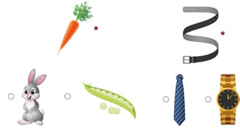
Figure 1: Example trials, test (left) and filler (right).

the two choice options, e.g., ear: eye/fan).