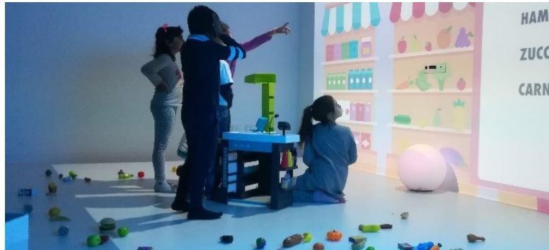
Children playing in a iMSE (Magic Room).

For example, virtual settings seem to be particularly suitable for subjects with ASDs as they allow a custom adaptation of specific features to the user personal characteristics (identifying strengths and weaknesses) [14].