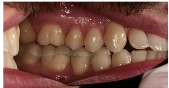
Figure 3: provisional onlays (left side).