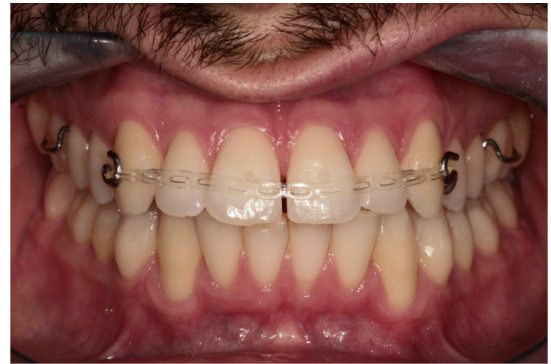
Figure 11: Hawley retainer with an elastic chain was to improve dental alignment.