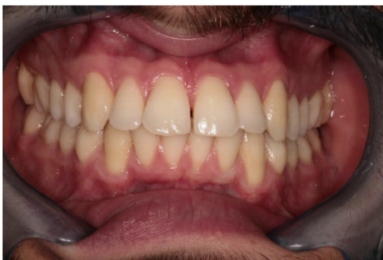
Figure 2: initial situation (frontal view).