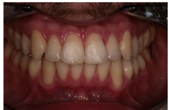
Figure 13: end of the treatment (frontal).