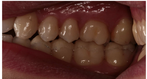
Figure 4: provisional onlays (right side).