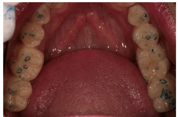
Figure 5: occlusion with the temporary resin onlays.