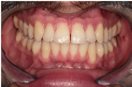
Figure 10: New occlusion with composite onlays (frontal view).