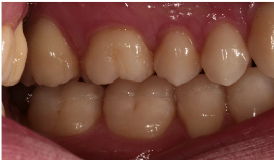
Figure 7: composite onlays made based on data obtained by the electromyographical analysis (left side)