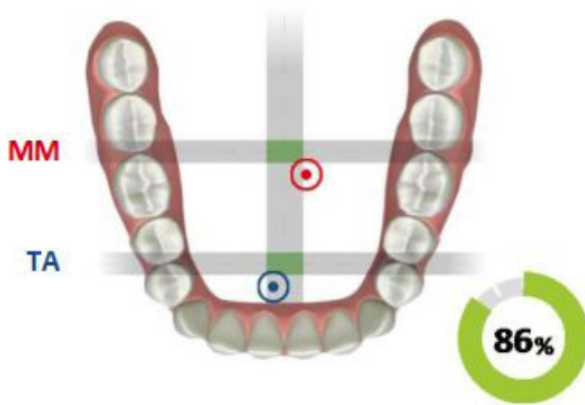
Figure 9: electromyographic analysis with definitive onlays.