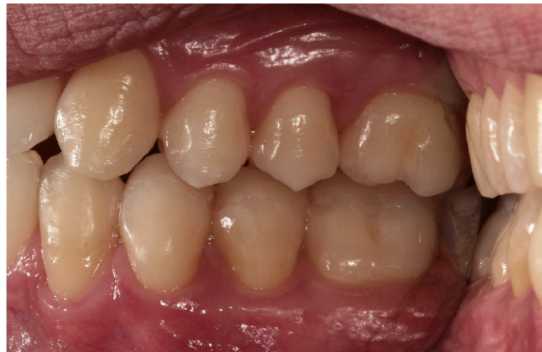
Figure 8: composite onlays made based on data obtained by the electromyographical analysis (right side).