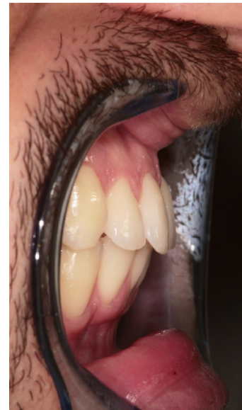
Figure 12: end of the treatment: lateral.